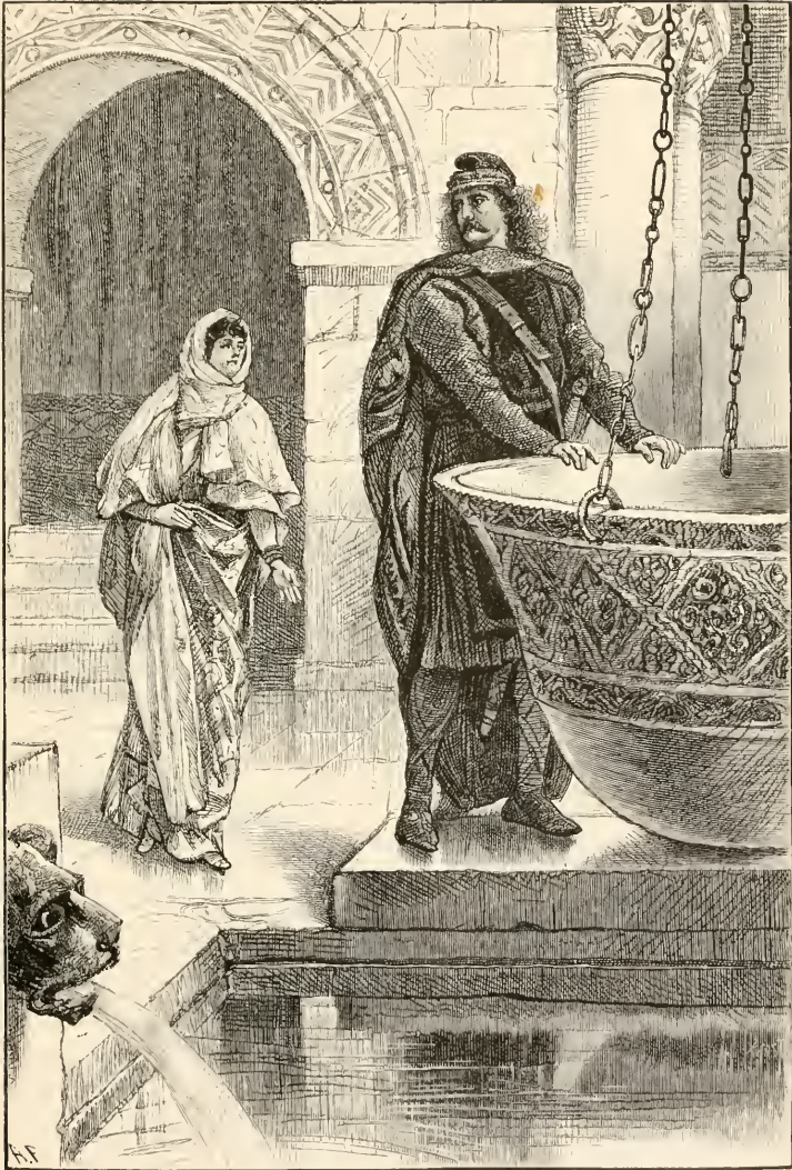
Pryderi Held Fast by the Enchanted Bowl.